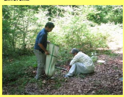
Fig. 5 sampling the leaf litter by Winkler collector in Caspian forest ecoregion.

As our study is still ongoing we can only present some of the preliminary results. Preliminary identification showed that collected ants belong to four subfamilies and 16 genera. In the Caspian forest ecoregion we collected ants from 8 genera (Temnothorax, Crematogaster, Aphaenogaster, Tetramorium, Lasius, Formica, Camponotus, and Ponera). Just in the Elburz Range forest steppe we found Myrmica sp. In arid and semi arid areas we collected ants from 12 (Cataglyphis, Camponotus, genera Lepisiota, Tetramorium, Messor. Cardiocondyla, Temnothorax, Pheidole, Crematogaster, Monomorium, Aphaenogaster, Tapinoma and Pachycondyla), although the structure of ant communities in different ecoregions was different.