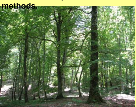
Fig. 3 Farim collection site in Caspian forest ecoregion (in Fig.1, number 5).

Based on our preliminary results we predict that we used too much effort for our sampling, especially about Caspian forests ecoregion. While we hypothesized high species richness of ground ants in the Caspian forest sites, we found only moderate diversity in this habitat. However, these prelimi-nary results have to be verified with species rarefaction