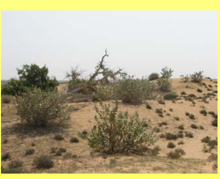
Fig. 4 Naiband sampling site in South Iran Nubo Sindian desert and semi desert ecoregion (in Fig. 1, number 10)

We used pitfall traps and bait traps for all the sites and added the Winkler collector method for the sampling of leaf litter in the Caspian forests. We used a total of 60 pitfall traps, that were placed in two 300 m-transects. Traps were collected after 3 days. In each sample site we set up 66 bait traps with sugar water and tuna fish in a grid (6 x 11) with the traps baits spaced 10 m intervals, for two days.