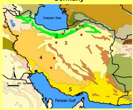
Fig. 2 Map of ecoregions of Iran, documenting five main ecoregions that were sampled along our transect (1- Caspian Hyrcanian mixed forests, 2-Elburz Range forest steppe, 3- Central Persian desert basins, 4- Zagros Mountains forest steppe and 5- South Iran Nubo Sindian desert and semi desert).